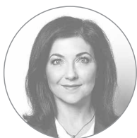
Katherina Reiche Chairwoman National Hydrogen Council Chairwoman Westenergie AG