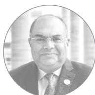
H.E. Dr. Mahmoud Mohieldin UN Climate Change High-Level Champion for Egypt COP27