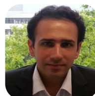
Deger Saygin Shura Energy Transition Center